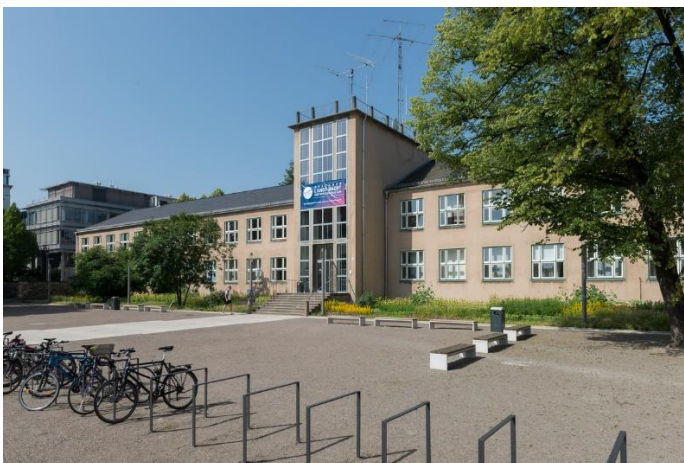
Barkhausen-Bau: Main entrance seen from Mommsenstraße

The summer school will take place at Barkhausen-Bau, the main building of the previous faculty of electrical engineering, in D wing, room BAR I88 (first floor), for details see https://navigator.tu-dresden.de/etplan/bar/01/raum/142201.0290 .